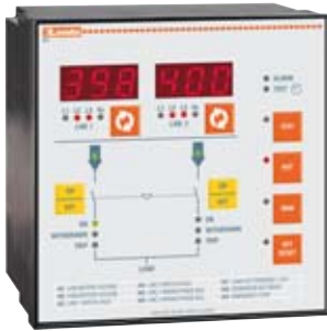
ATL20 A240 ATL30 A240